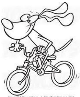
Sponsored Cycle Ride